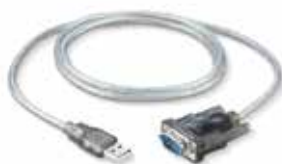
ST2901 Interface cable for control unit configuration Interface cable for configuration of control units ST2121 and ST2124 with USB outlet