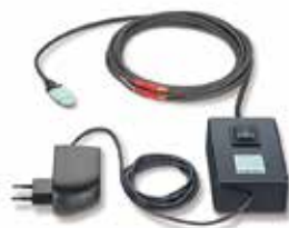
ST1811 Power Supply for configuration, test and assembly of M blinds With control-LED for main voltage and communication