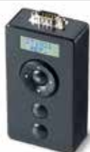
ST1821 Test kit for assembly and test of M blinds Allows the use of CTS software without PC through connection with Power Supply ST1811 (required)