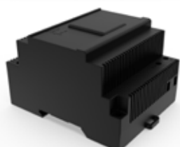
SL2712 Switching Power Supply 24V dc 2.5 A DIN rail mounting Dim.: 3 modules 52.5x90x54.5 mm (WxHxD)