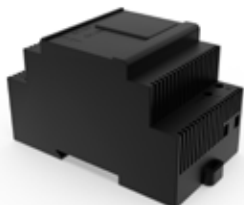
SL2711 Switching Power Supply 24V dc 1.3A DIN rail mounting Dim.: 2 modules 35x90x54.5 mm (WxHxD)